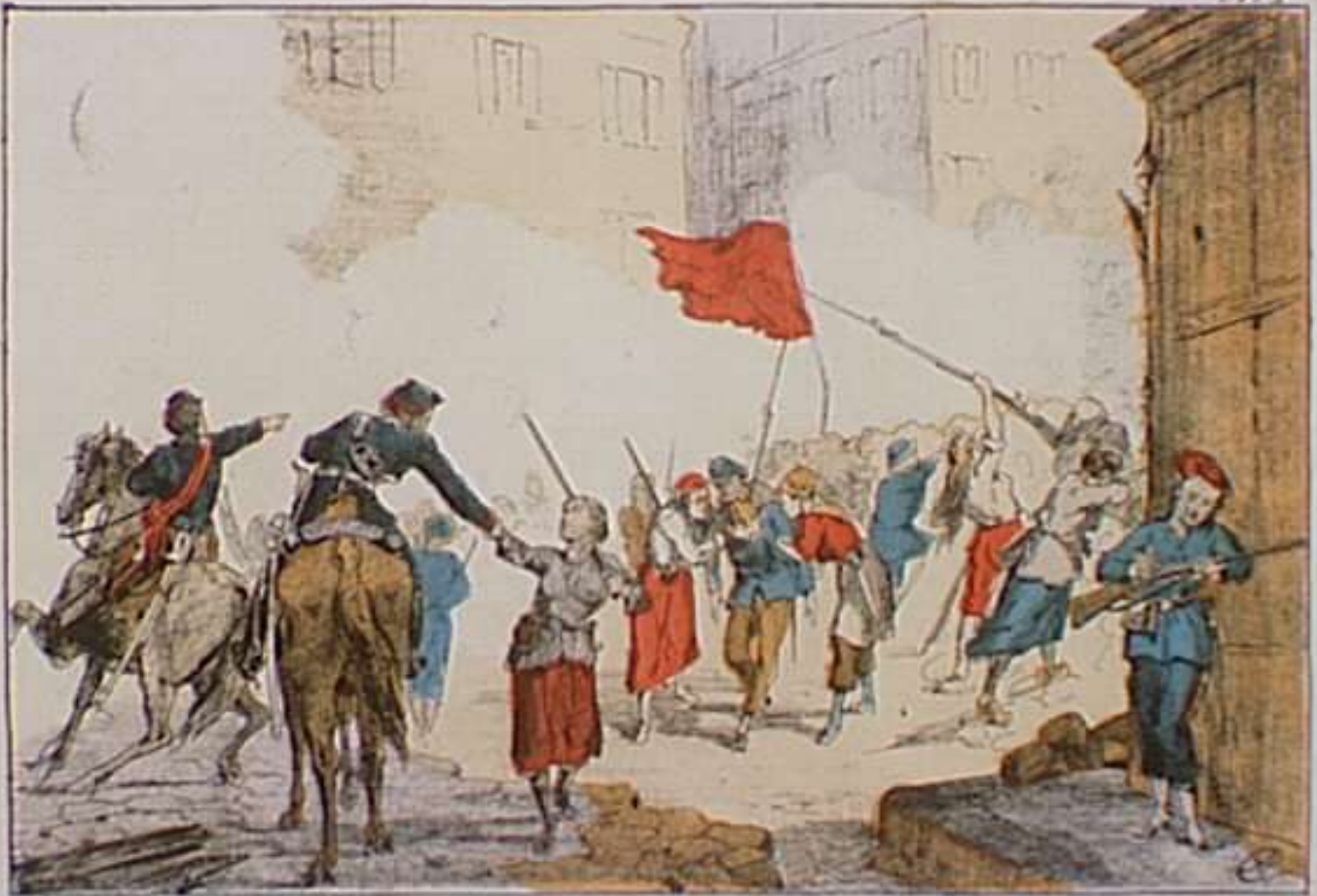
La barricade de la place Blanche défendue par des Femmes.