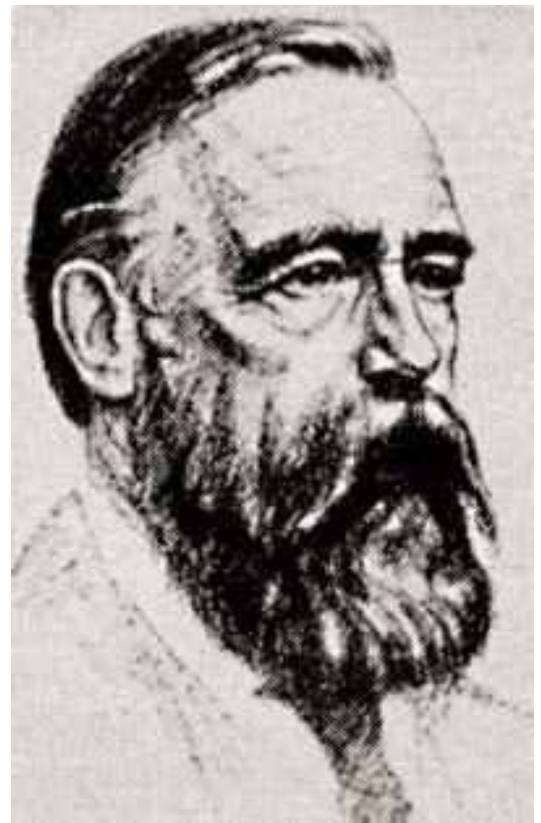
Friedrich Engels (1820-1895)