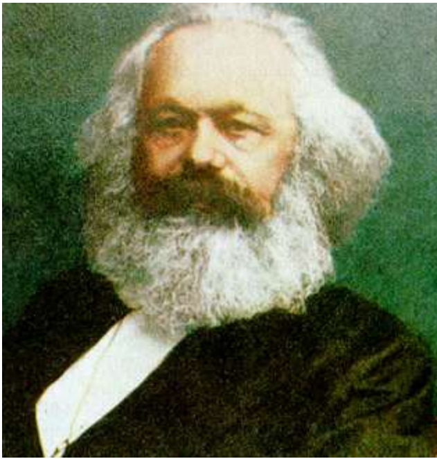
Karl Marx (1818-1883)